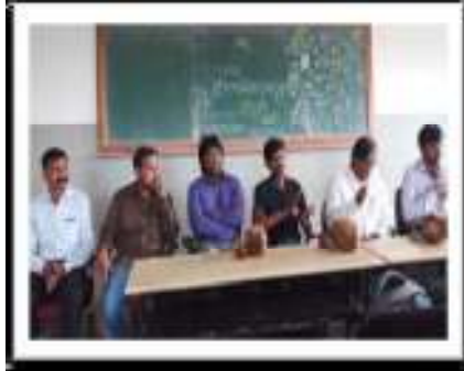
The Teacher day celebrating AE Department.