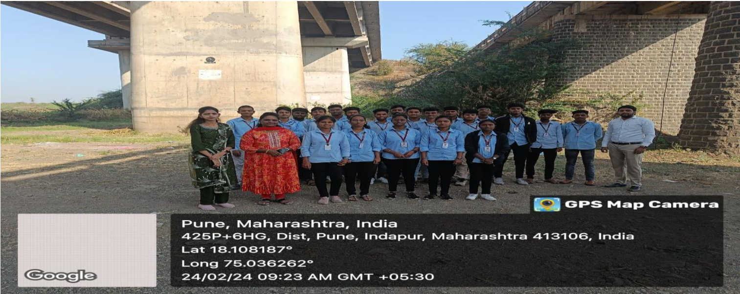
I] Industrial visit at Bhimanagar Bridge on dated 24/2/2024